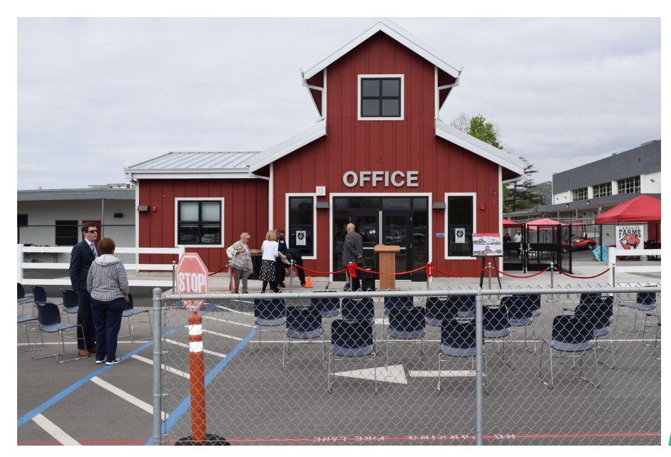
Lakeside Farms – Modernization