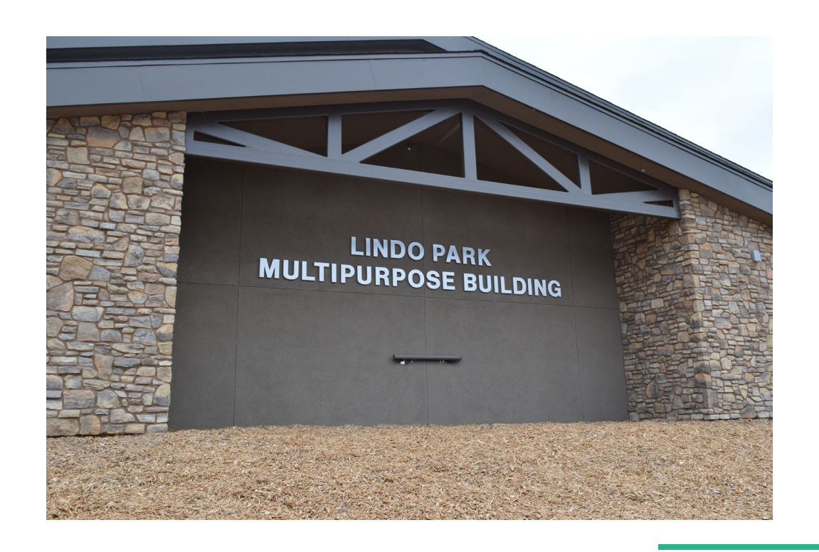
Lindo Park – Multipurpose Room and Kitchen Modernization