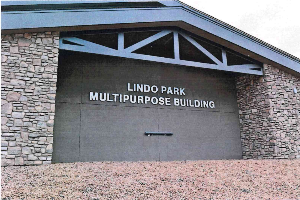
Lindo Park – Multipurpose Room and Kitchen Modernization