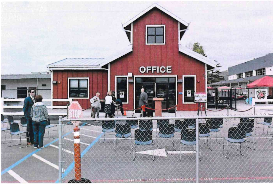
Lakeside Farms – Modernization